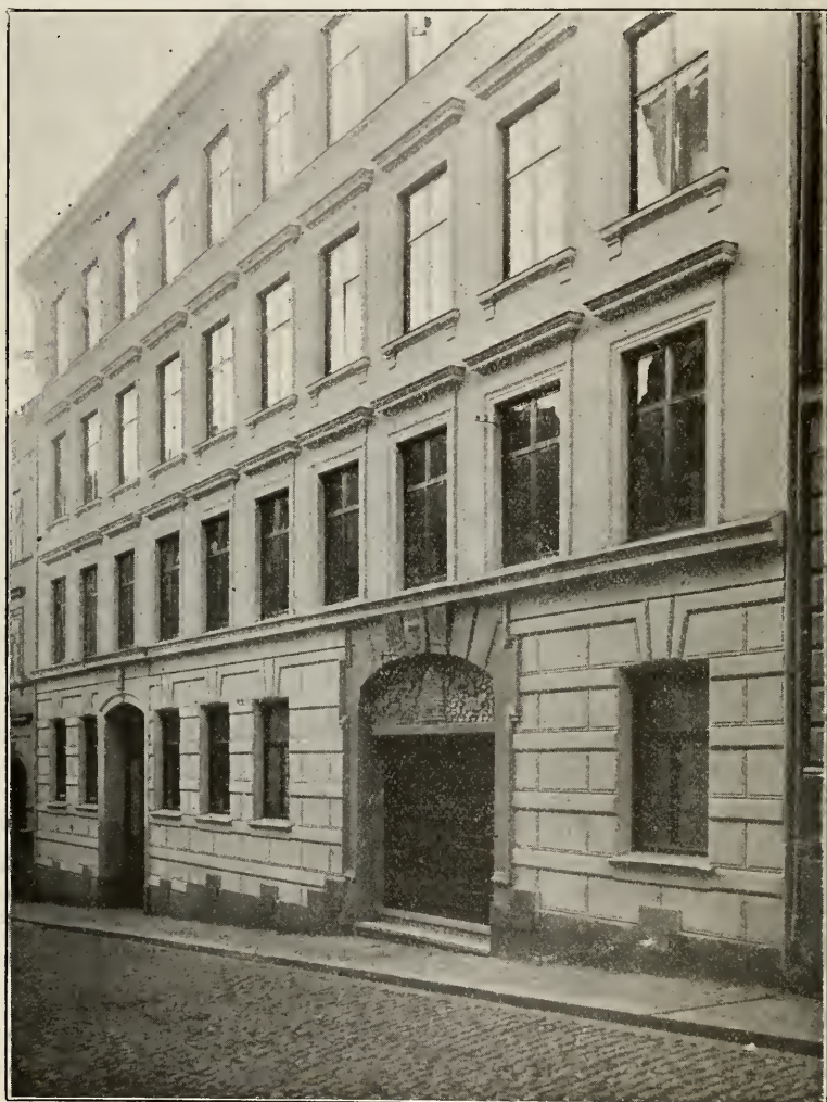
STOCKHOLM, SWEDEN, MISSION HOUSE

The next mission house was built the year afterwards on the same ground that the old mission house had stood on in Christiania. The old house had been built of poor materials and was